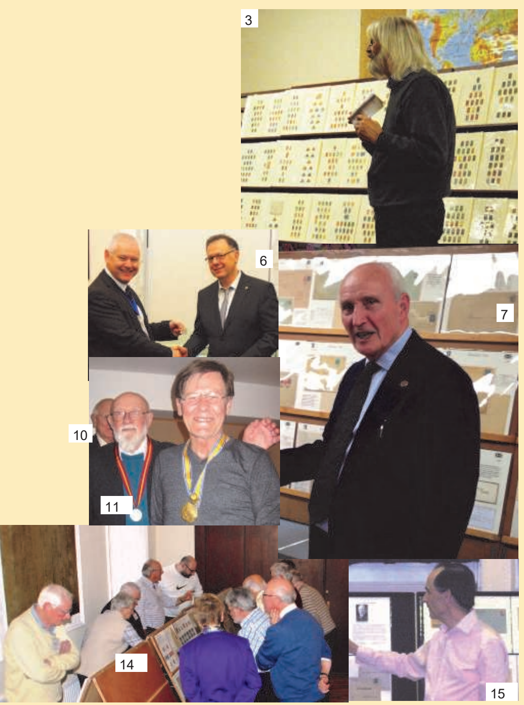
ABPS news, Spring 2017