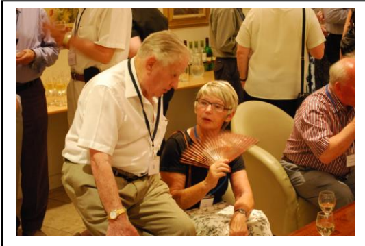
MEMBERS SOCIALISING IN THE BAR - 2014

The first Philatelic Congress of Great Britain was held in Manchester in 1909. Barring interruptions due to war, they have been held annually ever since. The venue moves each year. Congress is the opportunity to meet with fellow collectors for a relaxing few days in pleasant surroundings. The events include discussions, displays and visits, plus the ever-enjoyable Congress Banquet.